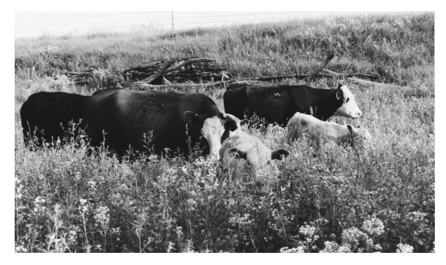
PLATE 1. Cattle on leafy spurge-infested rangeland near Terry, Montana (USA).

communities. Yet, this argument might seem flawed because, like the natives, the exotics could also recolonize from not-sprayed plots. However, herbicide never made the dominant exotic species ( E. esula ) rare. E. esula occurred in over half the sprayed-plot sampling frames during every year of sampling. Therefore, instead of relying on immigrating propagules, E. esula likely repopulated from surviving propagules within the sprayed plots.